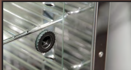
Toughened glass sliding doors