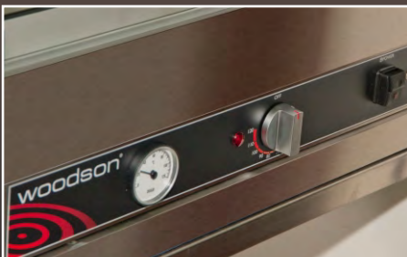
Precise thermostat control