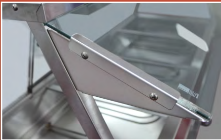
With optional sneeze guard