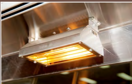
Quartz infra-red overhead heat lamps