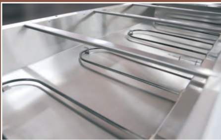
Multiple element design